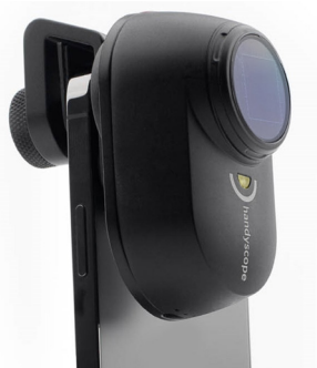
Figure 1: Handyscope® FotoFinder dermatoscope (DermLite/FotoFinder, 3Gen, Inc., USA) used for the trichoscopic examinations.

served as the reference standard for calculating sensitivity, specificity, positive predictive value, and negative predictive value.